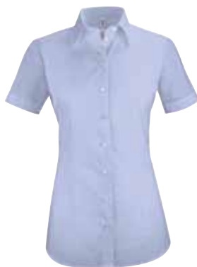
NO.: 6516.1120.029 BLEU | BLEU