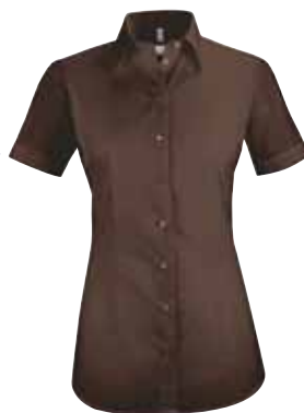
NO.: 6516.1120.030 BRAUN | BROWN