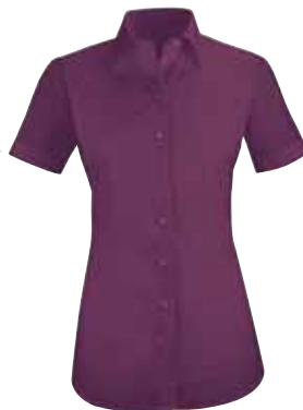
NO.: 6516.1120.060 BROMBEERE | BERRY

GEWEBE | FABRIC: 62% BAUMWOLLE | COTTON, 35% POLYESTER, 3% ELASTHAN | ELASTANE, 130 G/M 2