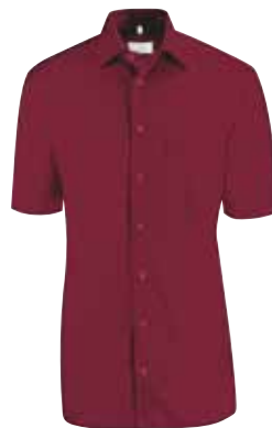
NO.: 6666.1120.053 BORDEAUX | BORDEAUX