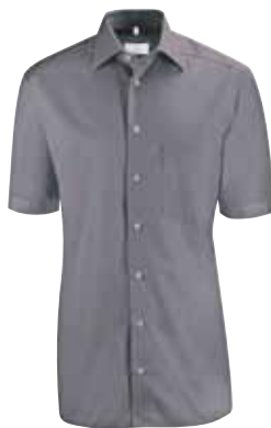
NO.: 6666.1120.011 ANTHRAZIT | ANTHRACITE