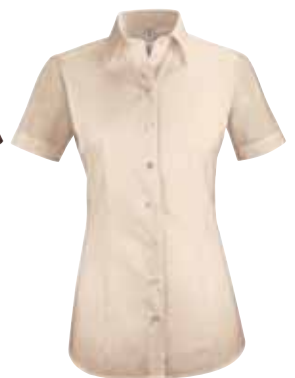
NO.: 6516.1120.037 BEIGE | BEIGE