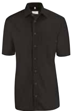
NO.: 6666.1120.010 SCHWARZ | BLACK