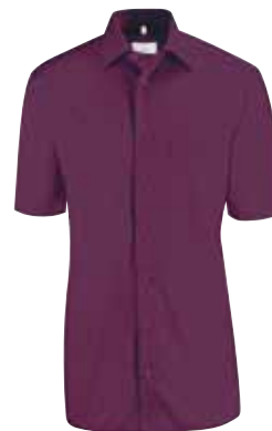
NO.: 6666.1120.060 BROMBEERE | BERRY

GEWEBE | FABRIC: 62% BAUMWOLLE | COTTON, 35% POLYESTER, 3% ELASTHAN | ELASTANE, 130 G/M 2