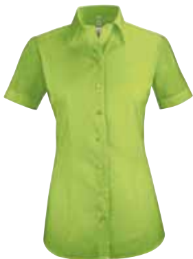
NO.: 6516.1120.044 APFELGRÜN | APPLE GREEN