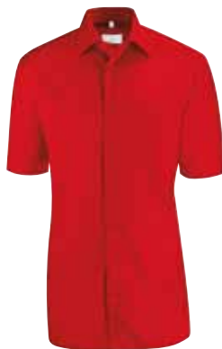
NO.: 6666.1120.050 ROT | RED