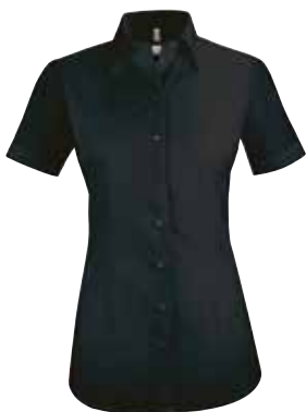
NO.: 6516.1120.010 SCHWARZ | BLACK