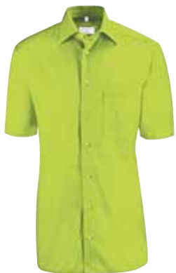
NO.: 6666.1120.044 APFELGRÜN | APPLE GREEN