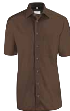
NO.: 6666.1120.030 BRAUN | BROWN