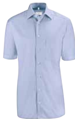
NO.: 6666.1120.029 BLEU | BLEU