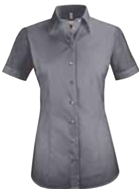
NO.: 6516.1120.011 ANTHRAZIT | ANTHRACITE