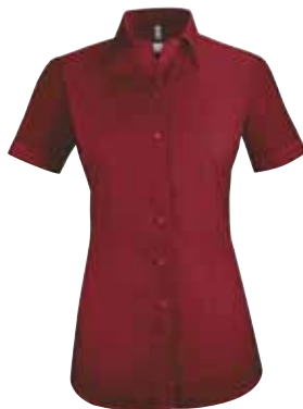
NO.: 6516.1120.053 BORDEAUX | BORDEAUX