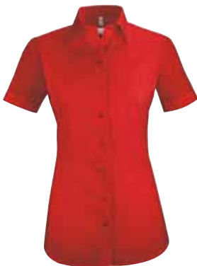
NO.: 6516.1120.050 ROT | RED