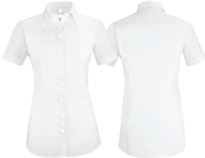
NO.: 6516.1120.090 WEISS | WHITE