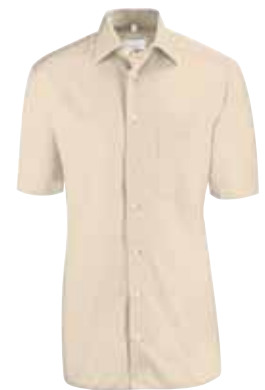
NO.: 6666.1120.037 BEIGE | BEIGE