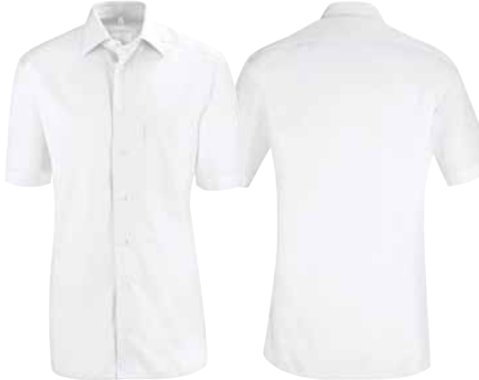
NO.: 6666.1120.090 WEISS | WHITE